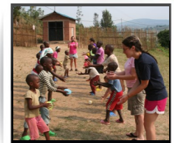
Fun with the kids in Rwanda